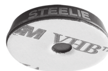
MAGNETIC PHONE SOCKET ADHESIVE BACKING