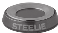
MAGNETIC PHONE SOCKET